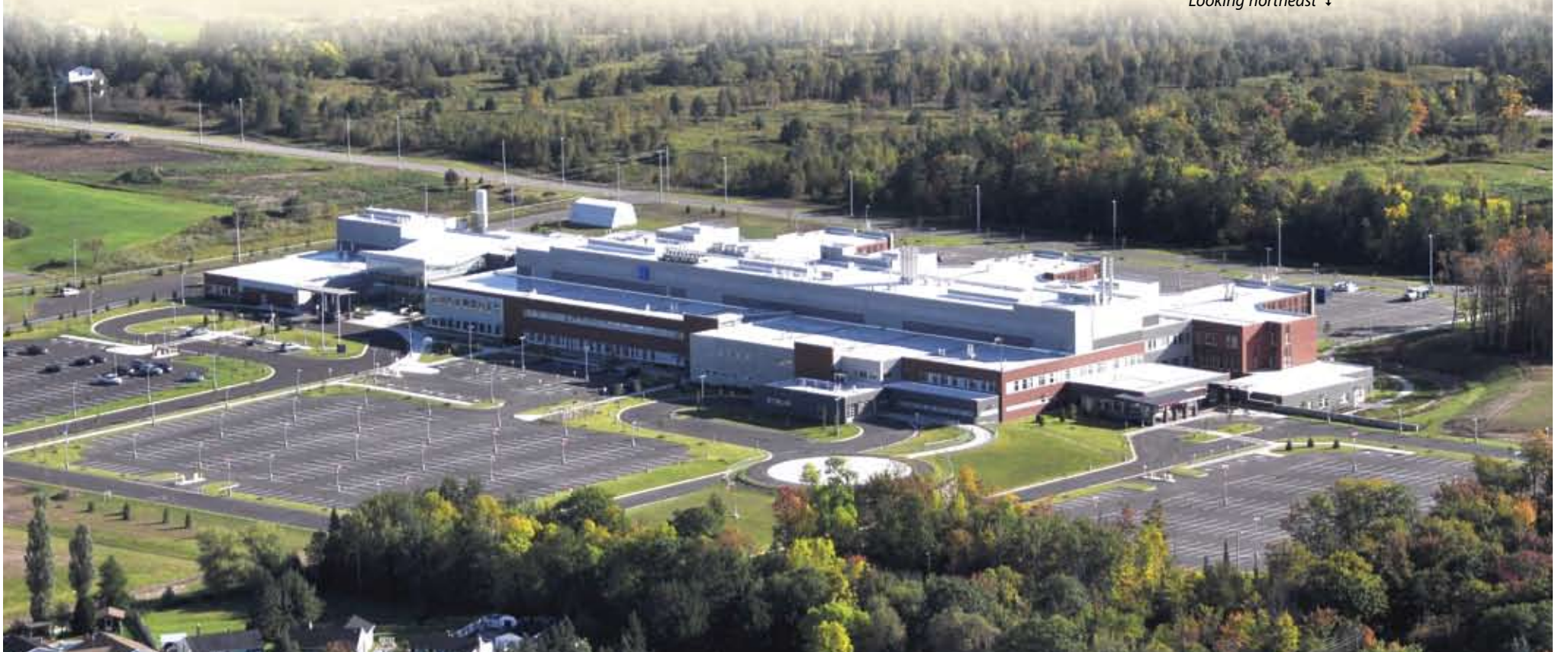
Looking northeast ↴